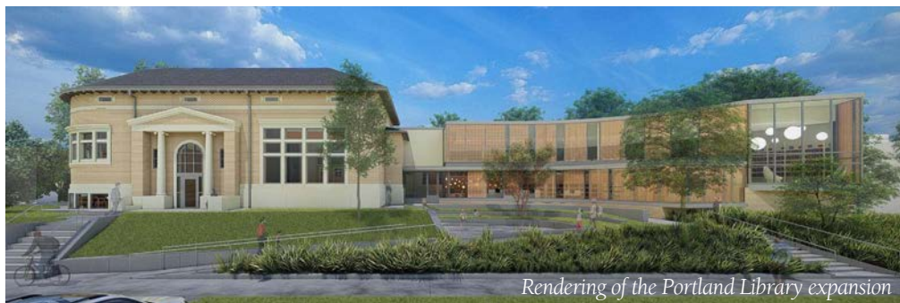
Rendering of the Portland Library expansion

In addition to Brainfuse, LFPL provides free access to some of the leading online research tools and databases, as well as ACT test prep classes and online practice tests. Visit LFPL.org/Kids and LFPL.org/Teens to explore everything LFPL offers to help students succeed in school this year.