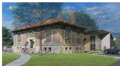
Rendering of Parkland Library and new addition

To stay up-to-date on all of these projects, subscribe to our bi-weekly Library Capital Projects newsletter at LFPL.org/newsletter .